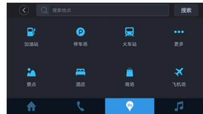
< Service selection screen >