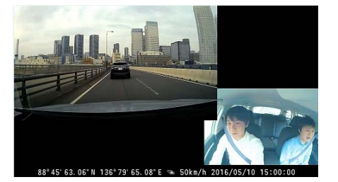
[Front & Interior Recording Screen]