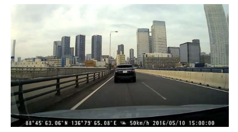
[Front Recording Screen]

The use of a high-performance car-mounted front camera provides clear images with a wide view angle that can clearly record the number plate of the car in front, even at night. It can also record LED traffic lights without synchronizing with their flicker cycles. SDXC memory cards with capacities up to 256GB are supported to ensure that even long-distance drives are recorded. Moreover, when a floor camera unit is attached, the driver can select from three recording modes, "front camera only," "front camera + floor camera" and "floor camera only," which also supports simultaneous recording of the front of the car and its interior*<sup>4</sup>. By attaching the floor camera unit to the rear hatch, the system can also record behind the car.