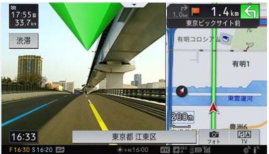
[Changing lane colors and sounding a warning tone to alert the driver]

The system alerts the driver via sounds and on-screen messages when the car has continuously veered to one side of the lane when driving on both expressways and ordinary roads*2.