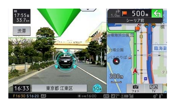
[Employs sophisticated image recognition technologies]

Pioneer introduces the Multi-Drive Assist Unit (hereafter, "MA Unit")*1, that works with its CYBER NAVI car navigation systems and uses sophisticated image recognition technologies to support advanced driving assistance functions.