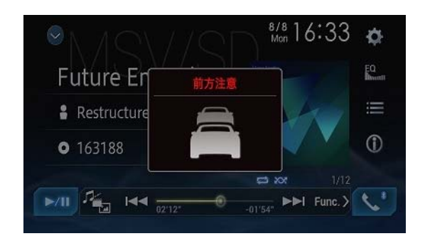
["CAUTION IN FRONT" is displayed on the navigation screen as well as AV screen]