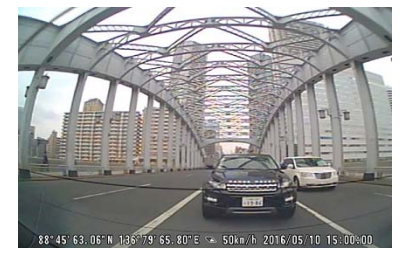
[Rear Recording Screen]