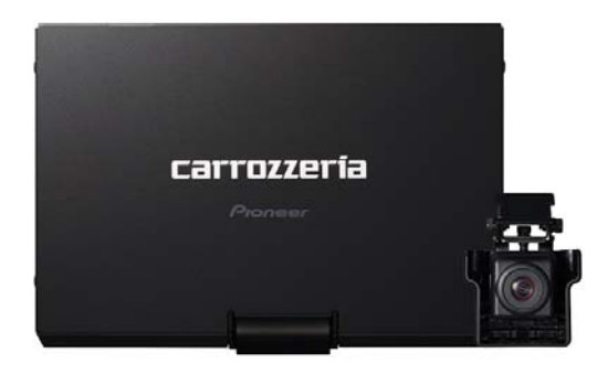
[Multi-Drive Assist Unit]